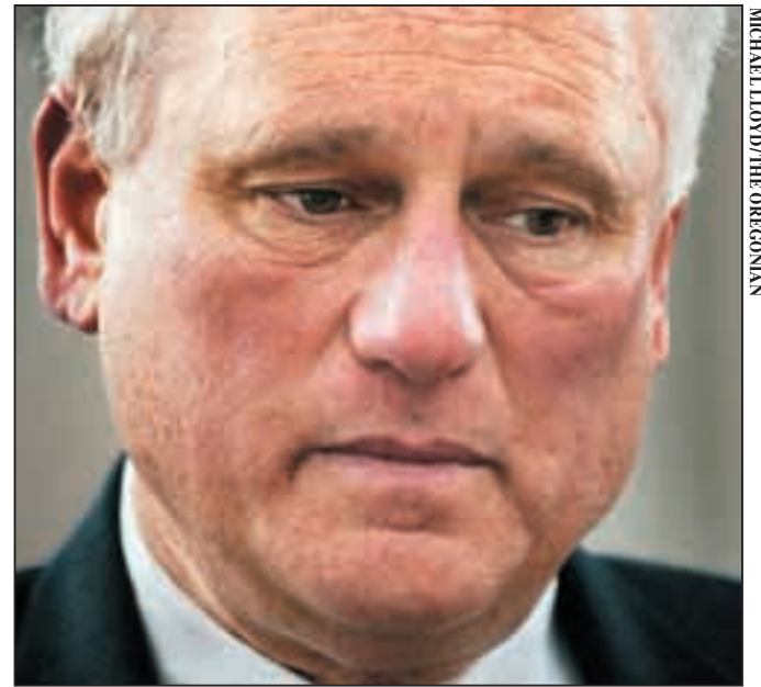
Personal scandal forced former Oregon Governor Neil Goldschmidt to resign as chairman of the state higher education board.