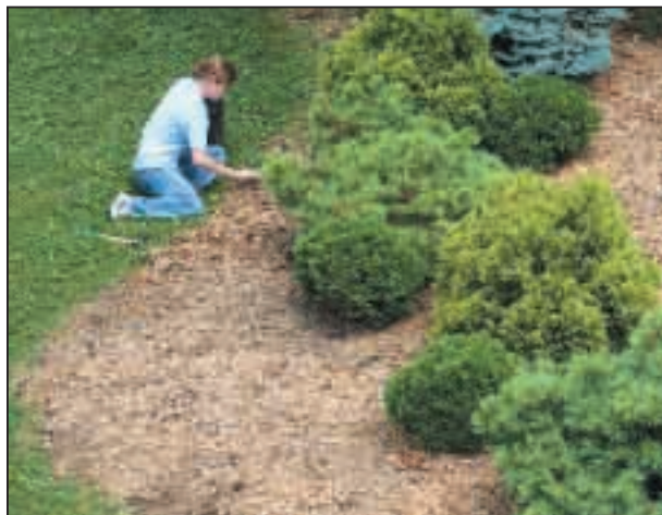
A student works in the college garden. Berea students pay no tuition but work ten to 15 hours a week in "labor positions."