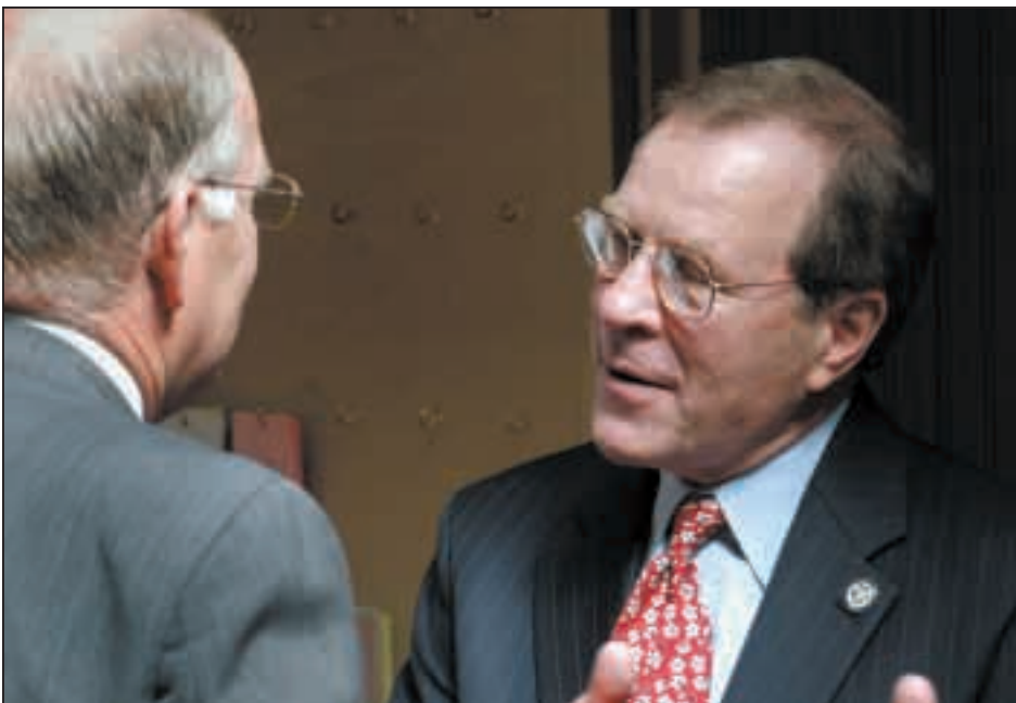
Oregon Governor Ted Kulongoski believes the state's economy and quality of life depend on an affordable, accessible higher education system.